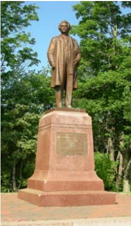
A statue of Mark Twain keeps an eye on the Mississippi River from this vantage point in Riverview Park.